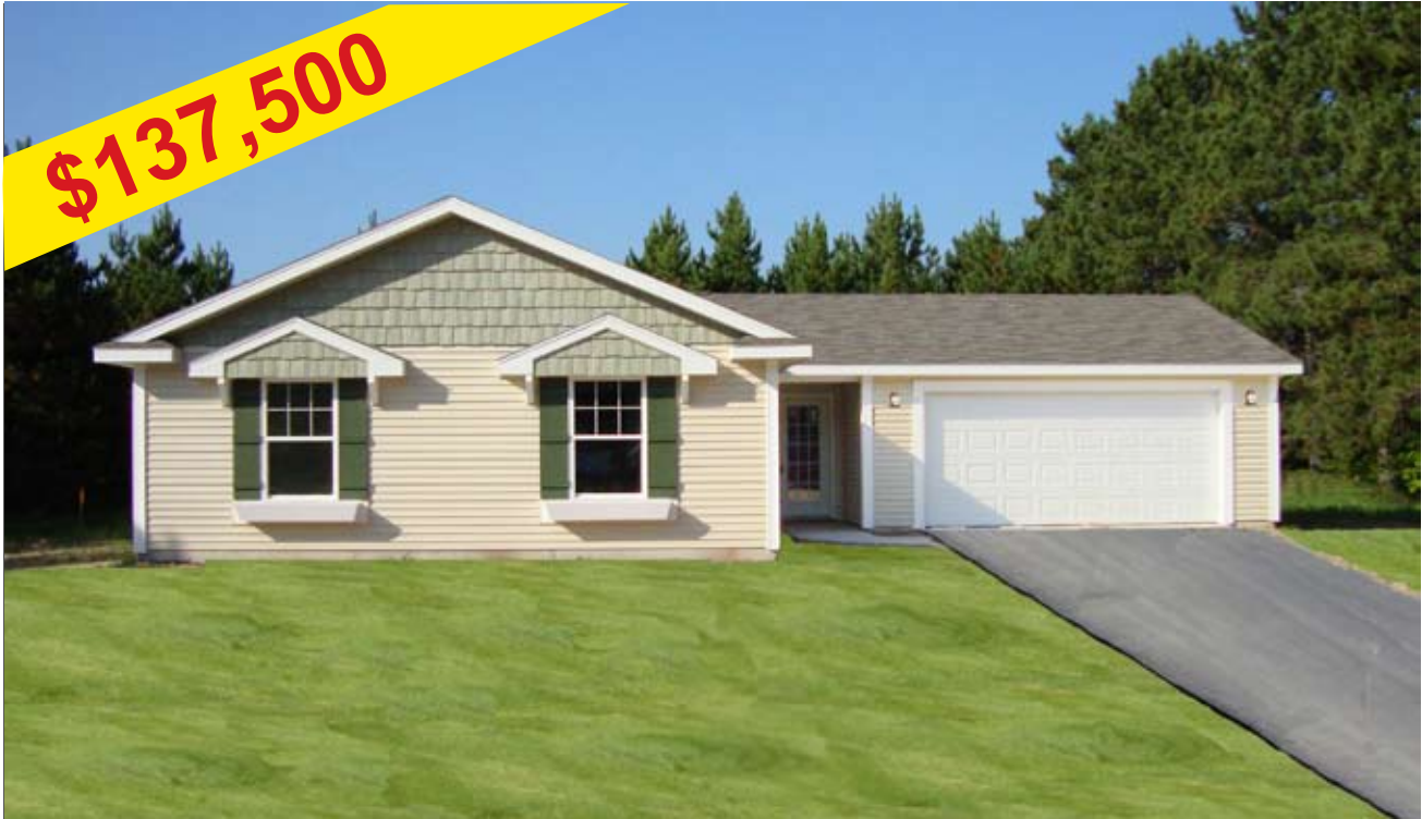
Actual property may differ from representation.