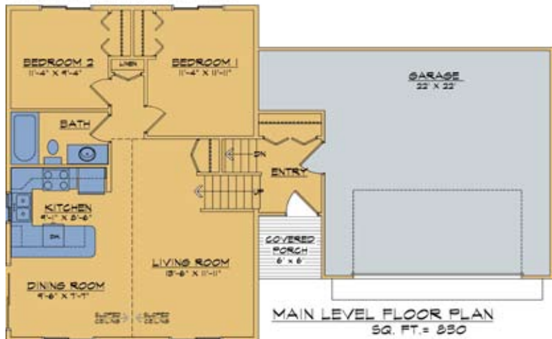
CRIMSON RANCH LOT #23